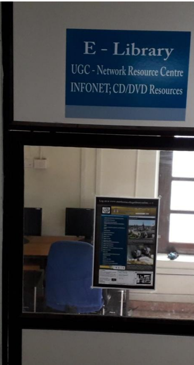
Latitude: 9.400463 Longitude: 76.584825 Accuracy: 26.6m Time: 17-07-2019 15:25 Note: B7 lib