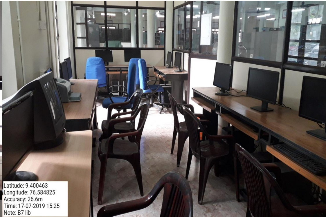
Latitude: 9.400463 Longitude: 76.584825 Accuracy: 26.6m Time: 17-07-2019 15:25 Note: B7 lib